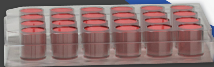
Cell culture containing cells and proteins

Pall Laboratory has a NEW 24-well, 7 mL, filter plate for use with protein purification/sterile workflows. This filter plate allows sterile 0.2 µm filtering of proteins from a cell culture solution in one step. Easily and quickly filter proteins from CHO, HEK or other cells cultures, with densities as high as 25 M cells/mL or more. Streamline workflows, reduce processing time, improve recovery – all in One Step.