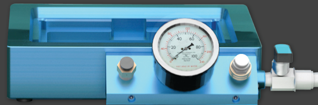
Vacuum or centrifuge to sterile filter proteins from a cell culture in one step